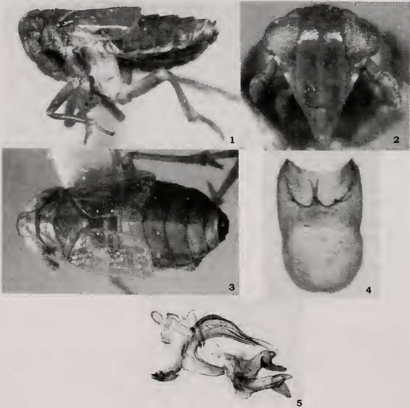
Figures 1-5. Scolopygos pallida sp. n. Fig. 1. Lateral view. Fig. 2. Frons. Fig. 3. Dorsal view. Fig. 4. Pygofer with aedeagal complex and anal segments removed. Fig. 5. Aedeagal complex (aedeagus, parameres, and connectives) and anal segment, lateral view of right side. (Figs. 1-3 paratype from type locality, 4-5 holotype.)

nearly quadrate (Fig. 2), widest at base of eyes, narrowed somewhat between eyes, frons and clypeus unicolorous, width ♂ 0.70-0.71, ♀ 0.80-0.85. Median carinae of frons rounded, obscure at fork just ventrad to fastigium. Frons height ♂ 0.52-0.55, ♀ 0.63; width ♂ 0.31-0.32, ♀ 0.32-0.33 (Ratio width: height ♂ 0.58-0.60; ♀ 0.50-0.53). Vertex quadrate, with all carinae rounded and somewhat obscure, not projecting cephalad. Vertex length ♂ 0.28-0.30, ♀ 0.32; width ♂ 0.25-0.27, ♀ 0.29 (Ratio length: width 0.83-0.94). Antennae short, segment I (♂) I 0.11-0.12mm, II 0.23-0.25 (Ratio I:II 0.46-0.47); (♀) I 0.13-0.15, II 0.28-0.30 (Ratio I:II 0.48-0.50). THORAX. Carinae rather obscure. Lateral carinae of pronotum obscurely reaching hind margin, or curving laterally just before hind margin. Pro- and mesonotum unicolorous, brownish-orange. Pronotum width ♂ 0.73-0.75, ♀ 0.87-0.92; length ♂ 0.20-0.21, ♀ 0.22-0.23. Mesonotum length ♂ 0.35-0.37, ♀ 0.42-0.43. Tegmina light amber (nearly clear), veins irregularly darker, setal bases on veins inconspicuous, length ♂ 0.90, ♀ 1.13. Metothoracic leg with